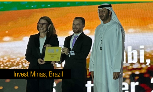
Invest Minas, Brazil