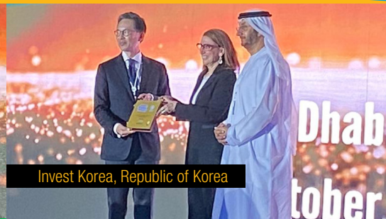
Invest Korea, Republic of Korea