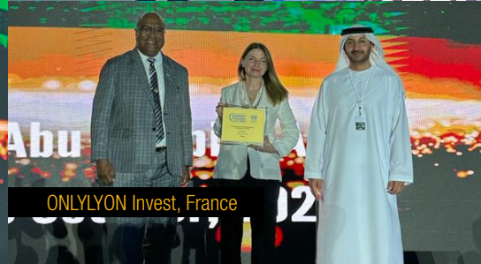
ONLYLYON Invest, France