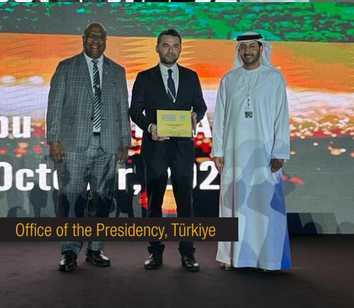
Office of the Presidency, Türkiye